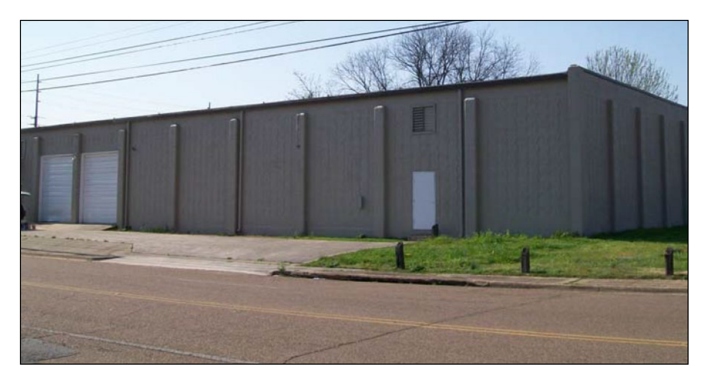
2012 Cox Avenue Huntsville, Alabama 35816