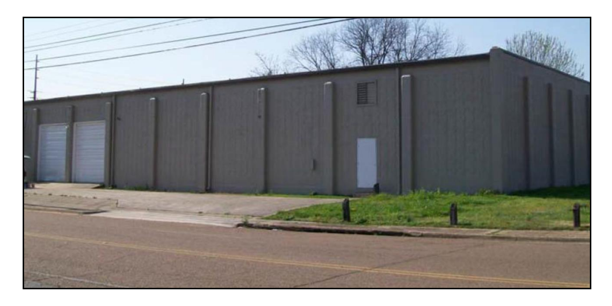
2012 Cox Avenue Huntsville, Alabama 35816